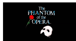
Phantom of the Opera