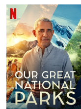
Our Great National Parks