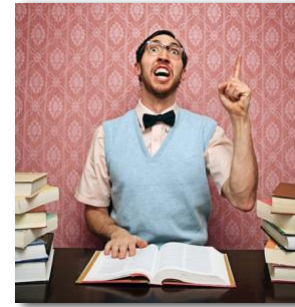
Utilize your erudite vernacular without fear of retribution or derision.

bobbleheads for the same reason they read tabloid magazines, go to the movies, and vacation in Las Vegas—adults use these outlets to escape the rigors and stresses of everyday life. And some collectors are amassing bobblehead collections worth thousands! Vintage bobbleheads from the 1960s are worth $10,000. Bobbleheads have grown so popular they have their own holiday on January 7.