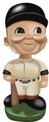
The first bobbleheads were ceramic "temple nodders," religious figurines set in Buddhist temples.

Of course, before 1851, humans understood that a day had 24 hours. Foucault was simply the first to prove it using instruments on Earth's surface.