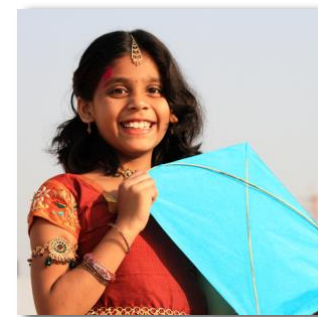
It is believed that kite flying came to India from China, where kites were used to measure distances.

Travel to the Indian state of Gujarat on January 14 and you will find the skies filled with millions of kites for the International Kite Festival. Kite flying is more than just a recreational pastime; it is a significant cultural practice for many Indians.